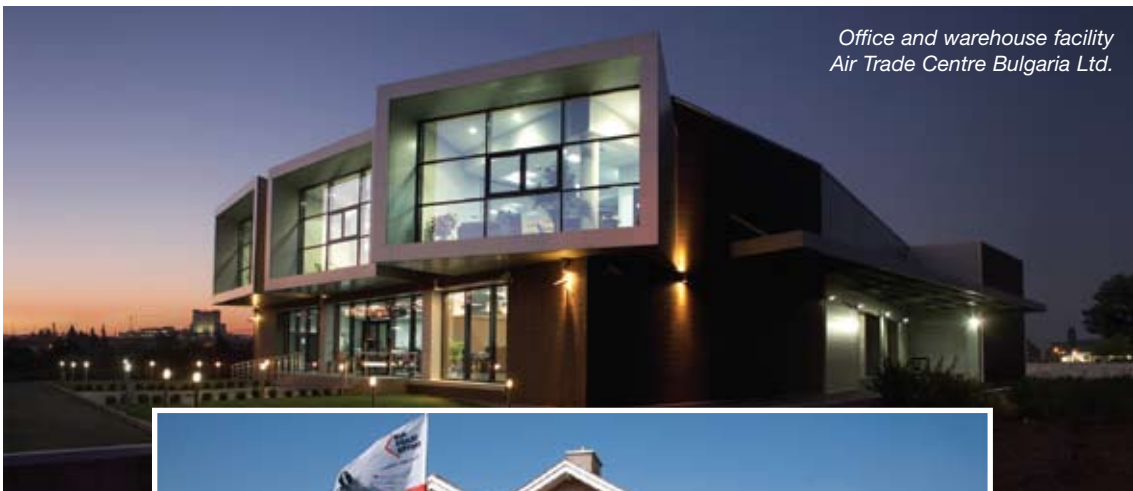
Office and warehouse facility Air Trade Centre Bulgaria Ltd.