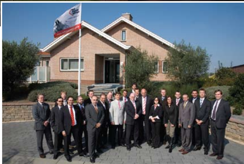
Senior Management meeting 2008, held at the Group Head Office WaterfrontHouse, in The Netherlands.