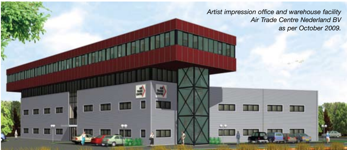
Artist impression office and warehouse facility Air Trade Centre Nederland BV as per October 2009.