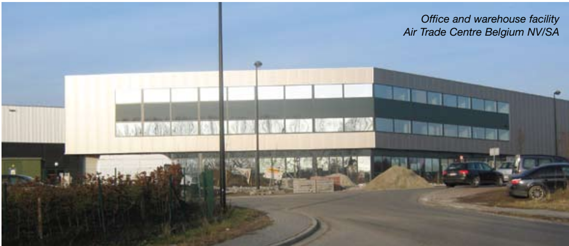
Office and warehouse facility Air Trade Centre Belgium NV/SA